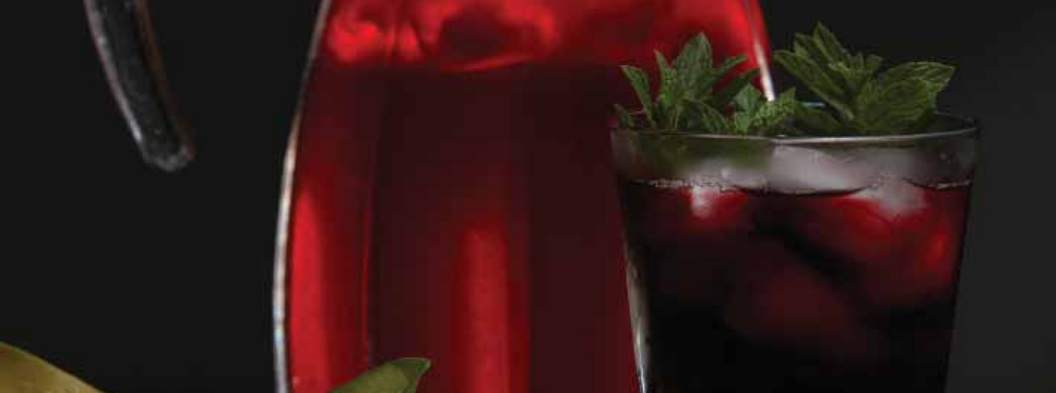
~ BISSAP JUICE ~