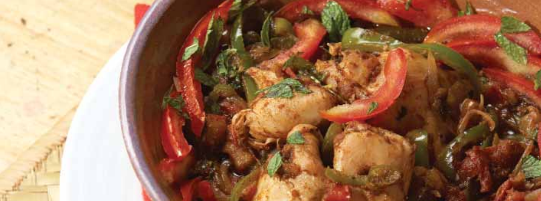
~ SHITTO-STYLE CHICKEN ~