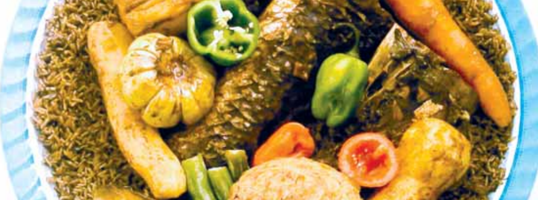
~ TIEBOU DIEUNE ~