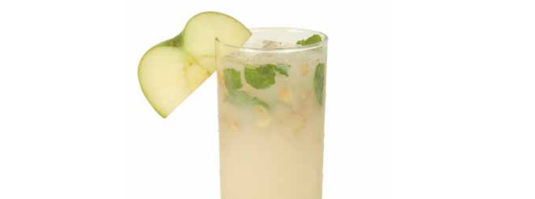
~ GINGEMBRE JUICE ~