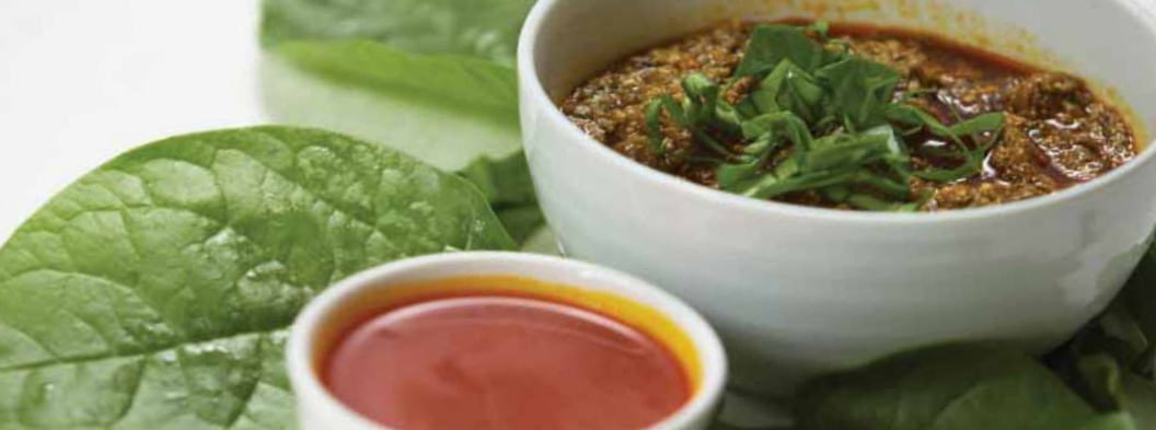
~ PALAVA SAUCE ~