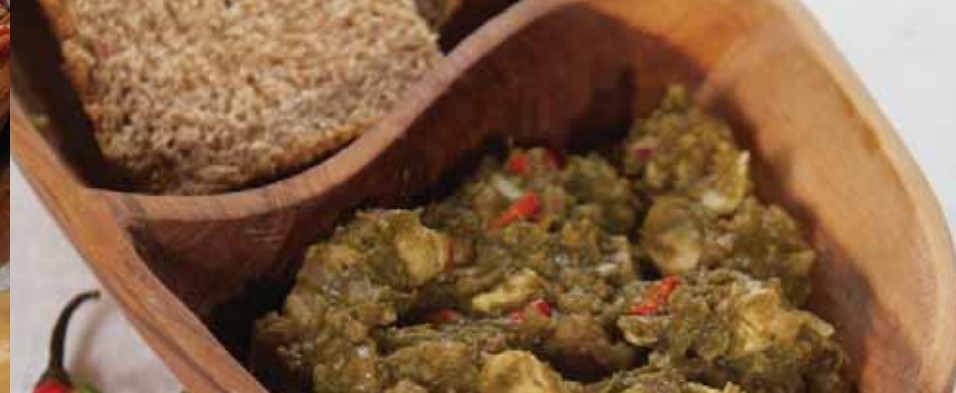
~ MOUKO SHIW ~