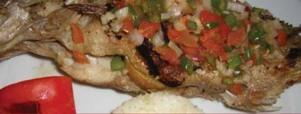
~ BAKED FISH WITH HIBISCUS LEAVES SAUCE ~