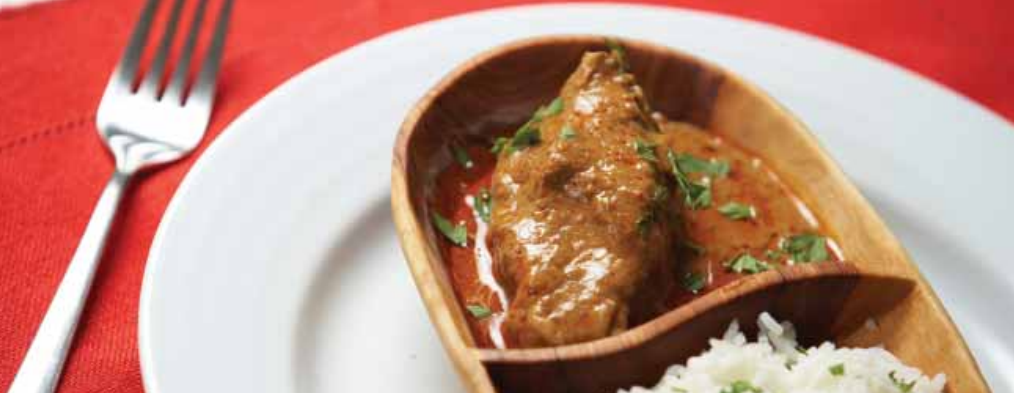
~ GROUNDNUT SOUP ~