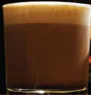
~ KOLA COFFEE MOCHA ~