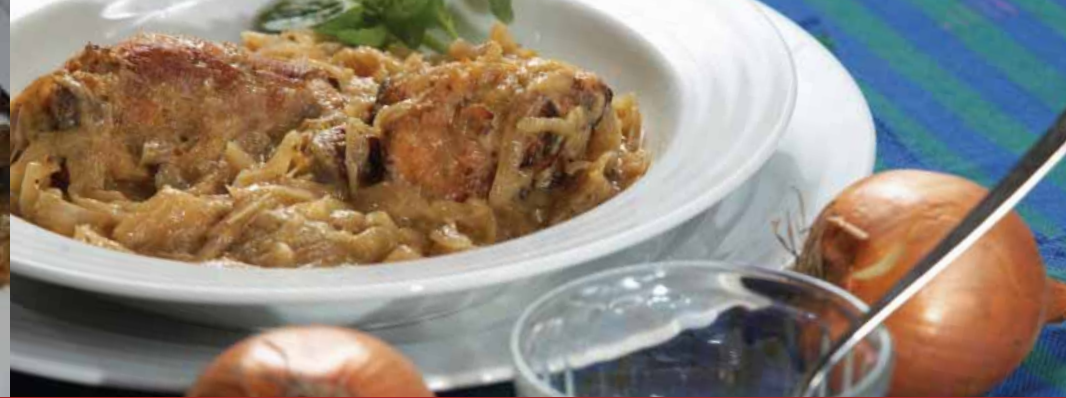
~ CHICKEN YASSA ~