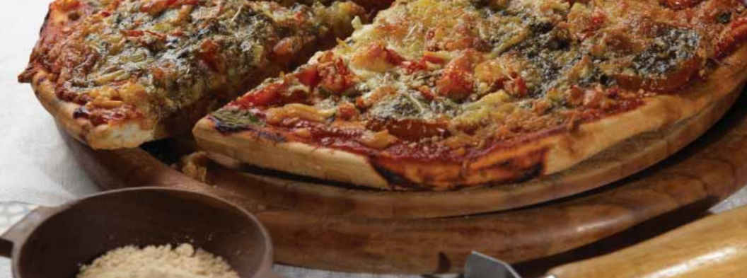
~ MILLET PIZZA ~