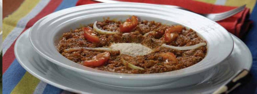
~ RED RED WITH GARI ~