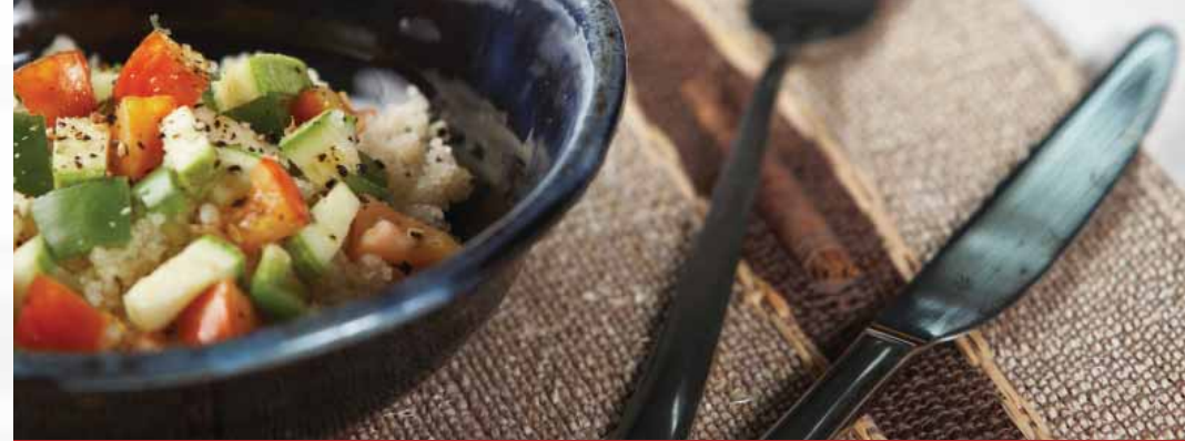
~ ATTIEKE SALAD WITH FISH ~